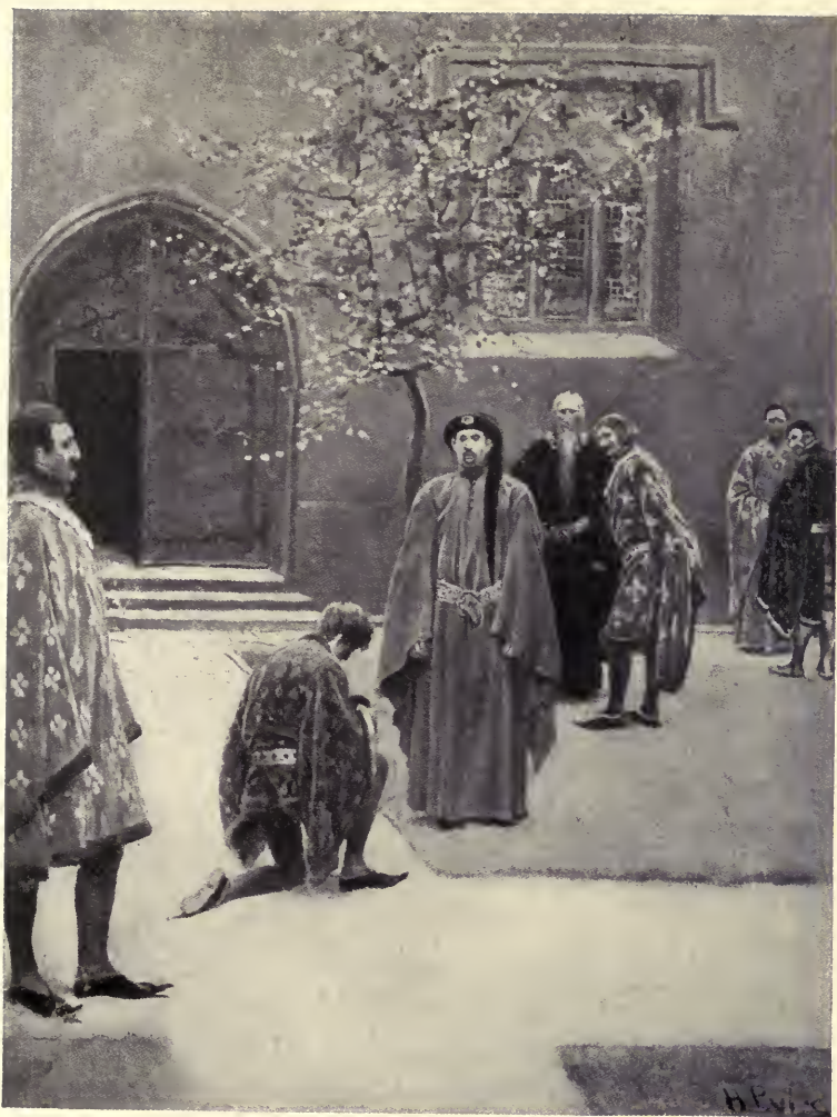
"Lord George led him to where the King stood"